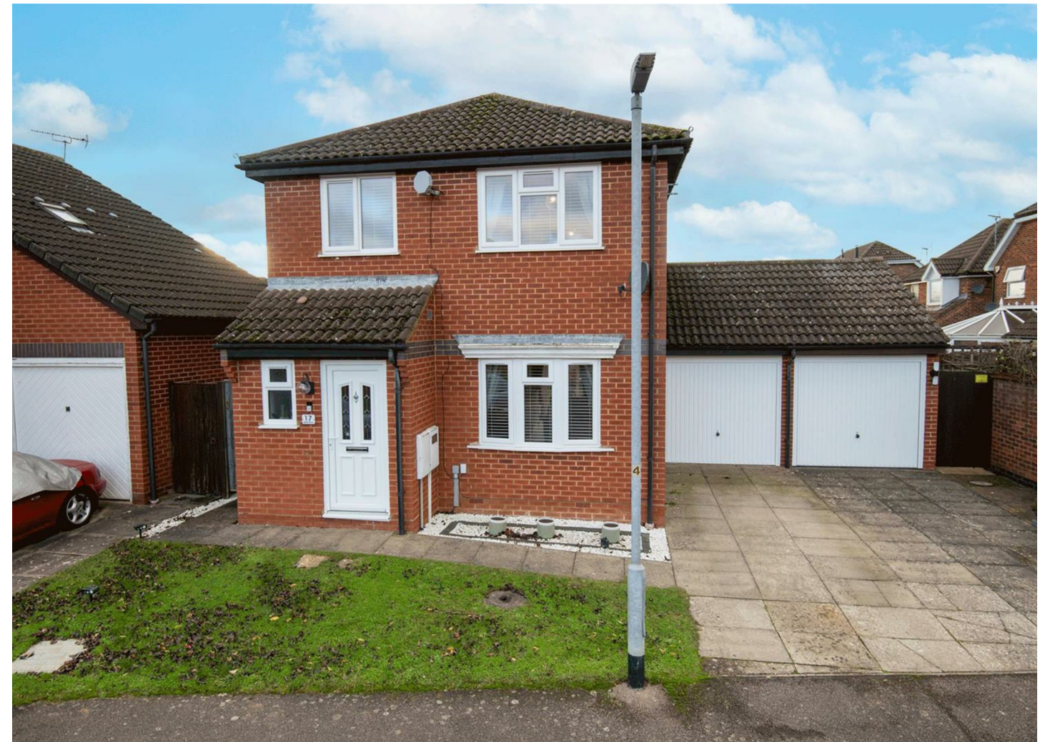
17 Beech Drive, Wellingborough, NN8 3GG