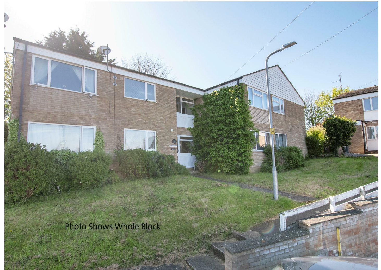
Photo Shows Whole Block

sales 01933 224444 lettings 01933 222233 www.hawksbys.net