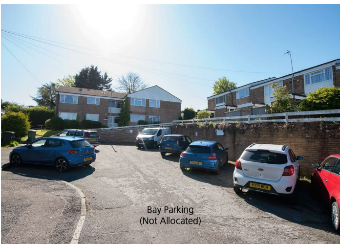
Bay Parking (Not Allocated)