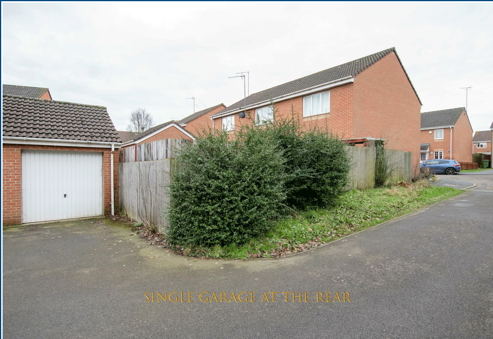
SINGLE GARAGE AT THE REAR