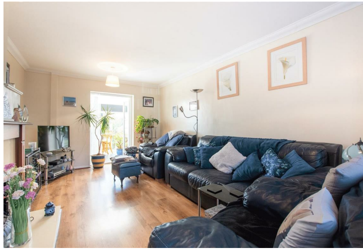
Lounge 17'8" x 10'7"