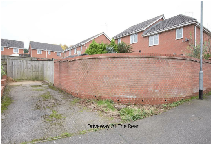
Driveway At The Rear