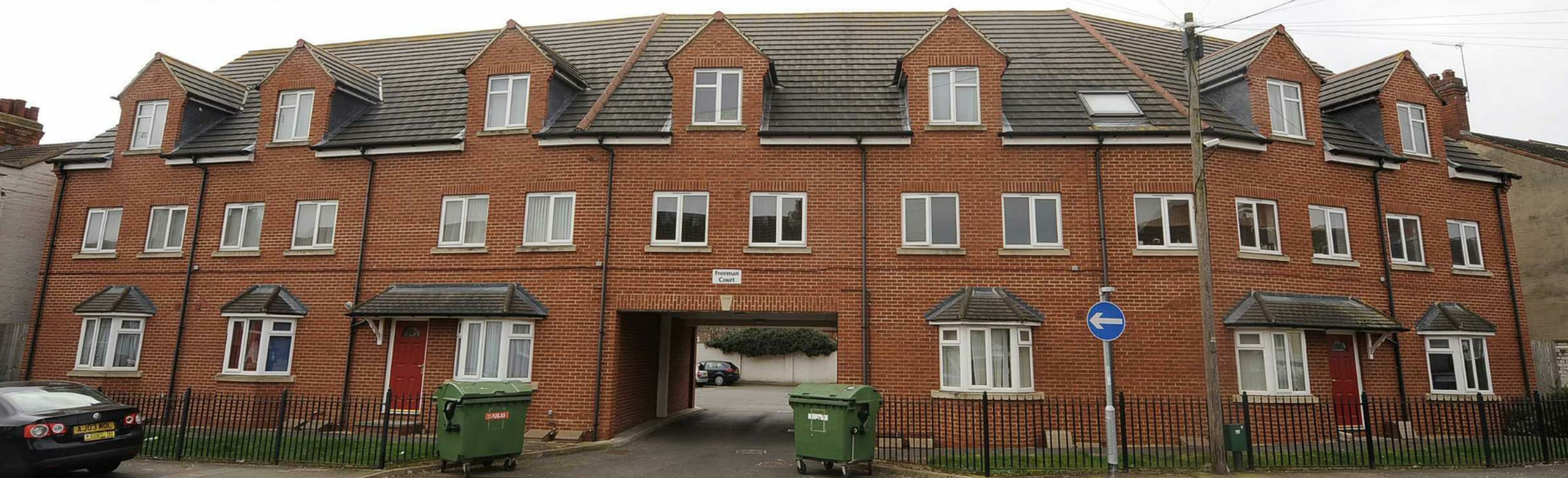
Photo Shows Whole Block From The Front

Flat 2 Stanley Road, Wellingborough, NN8 1BF