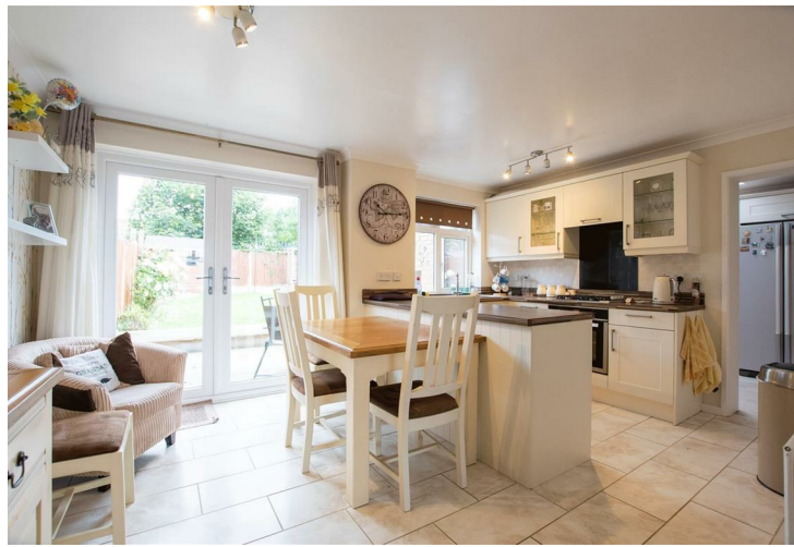
Lounge 15'2" x 12'7"