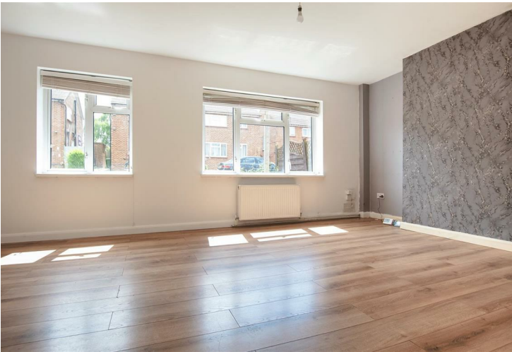
Entrance Hall Lounge/Diner 19'2" x 12'0" max