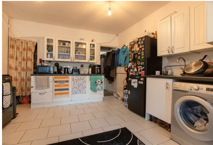
Tenure: Freehold Council Tax Band: A