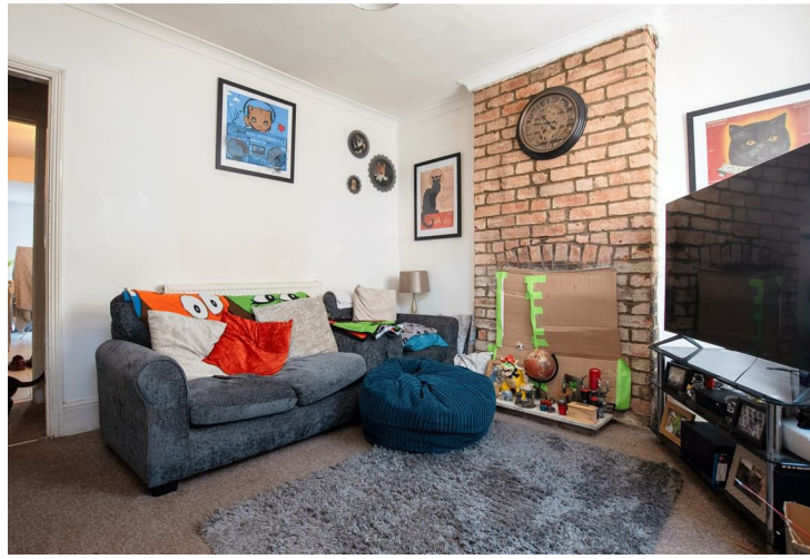
Lounge 11'8 max x 10'10