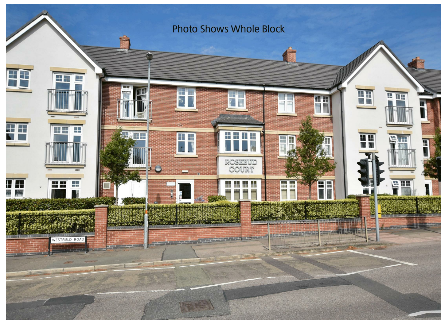
Photo Shows Whole Block

sales 01933 224444 lettings 01933 222233 www.hawksbys.net