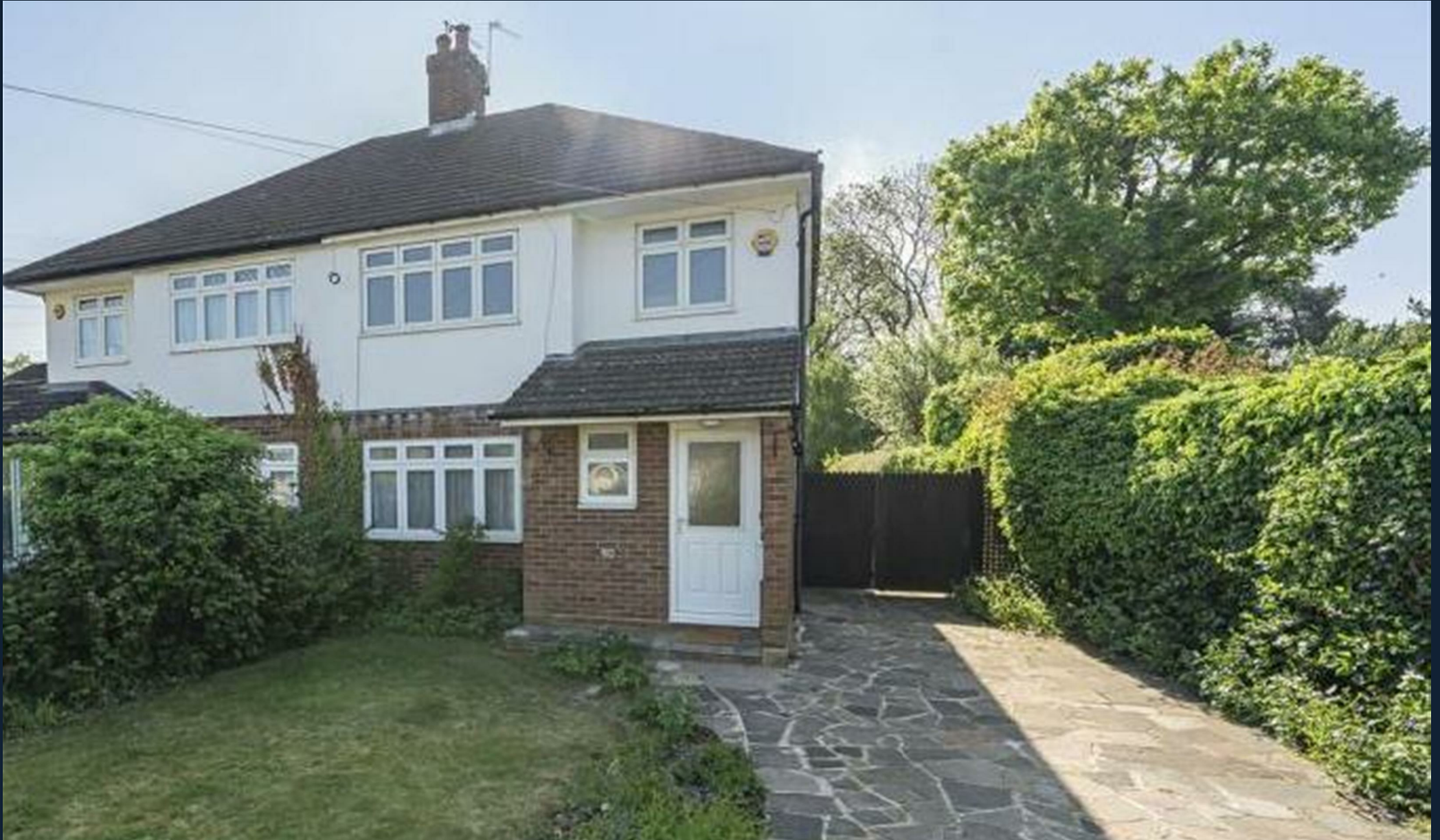
30 WEST RIDING, BRICKET WOOD, ST. ALBANS, HERTFORDSHIRE, AL2 3QW GUIDE PRICE £610,000