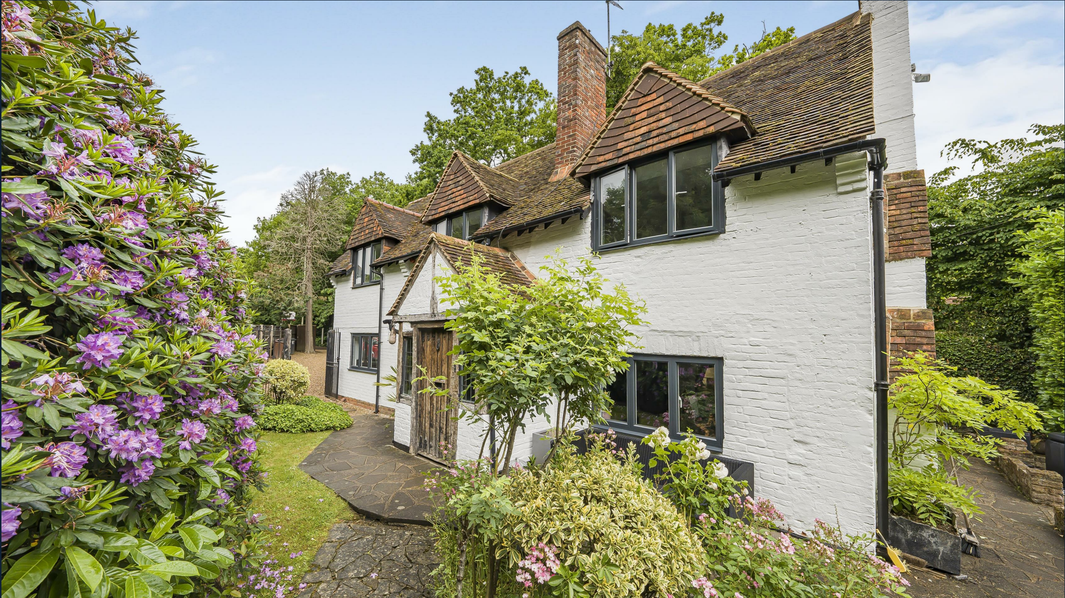
April Cottage Mount Pleasant Lane, Bricket Wood, St. Albans, AL2 3XH