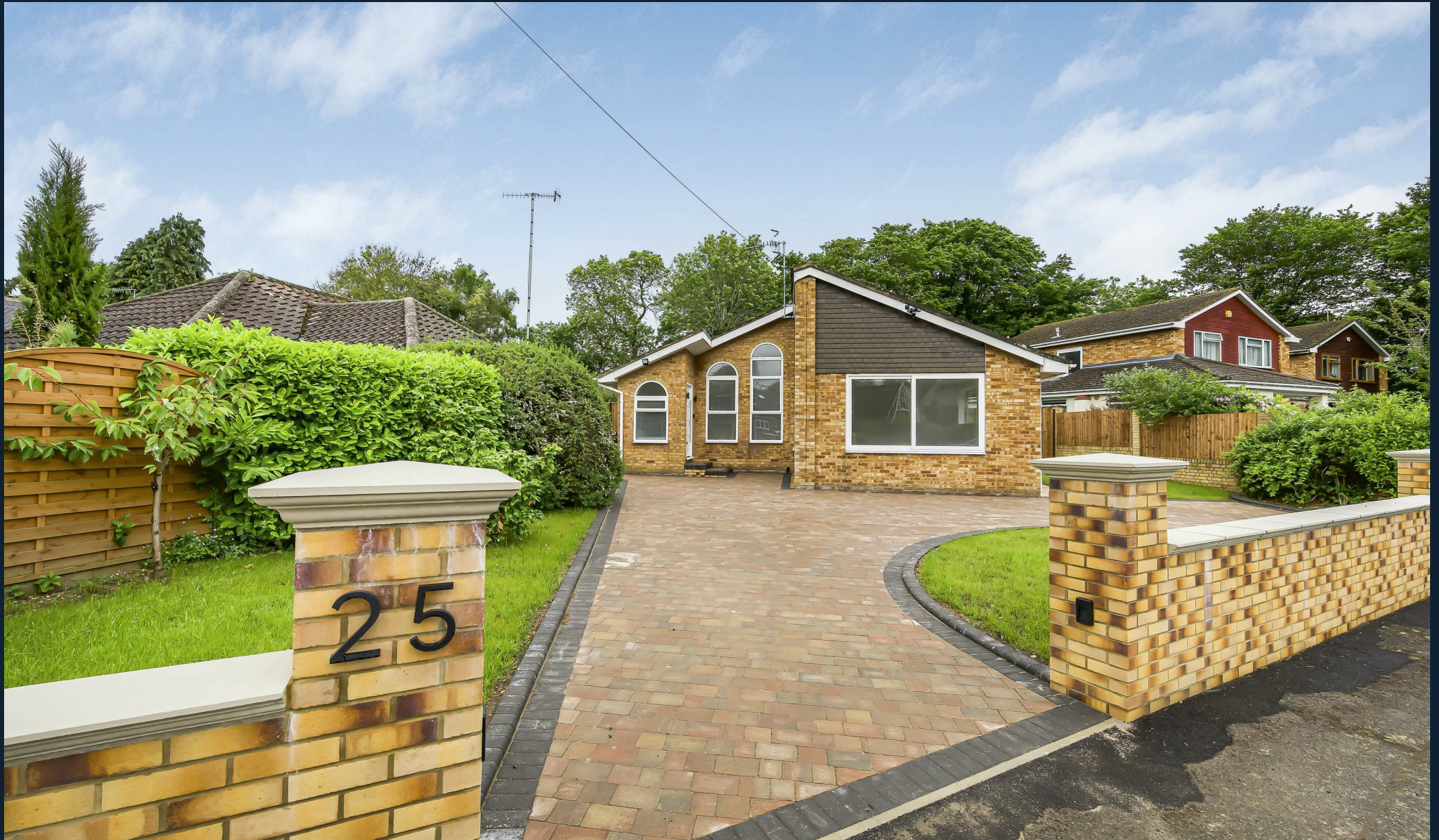
25 OAKWOOD ROAD, BRICKET WOOD, ST. ALBANS, AL2 3PT GUIDE PRICE £810,000