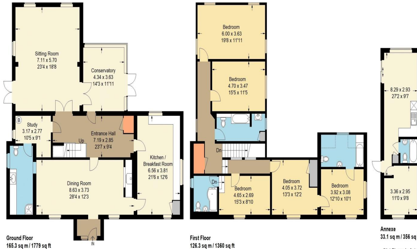
Illustration for identification purposes only, measurements are approximate, not to scale. floorplansUsketch.com © (ID542798)

The property is 'bought as seen' and the Agents are unable to comment on the state and condition of any fixtures, fittings and appliances etc.