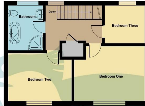
FIRST FLOOR Approx. 521 SQFT (INTERNAL)