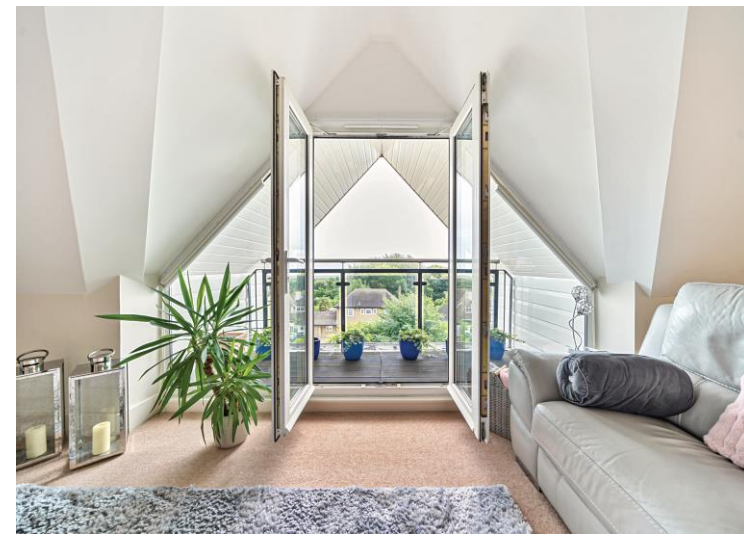
To view this property call Colebrook Sturrock on 01303\ 260666