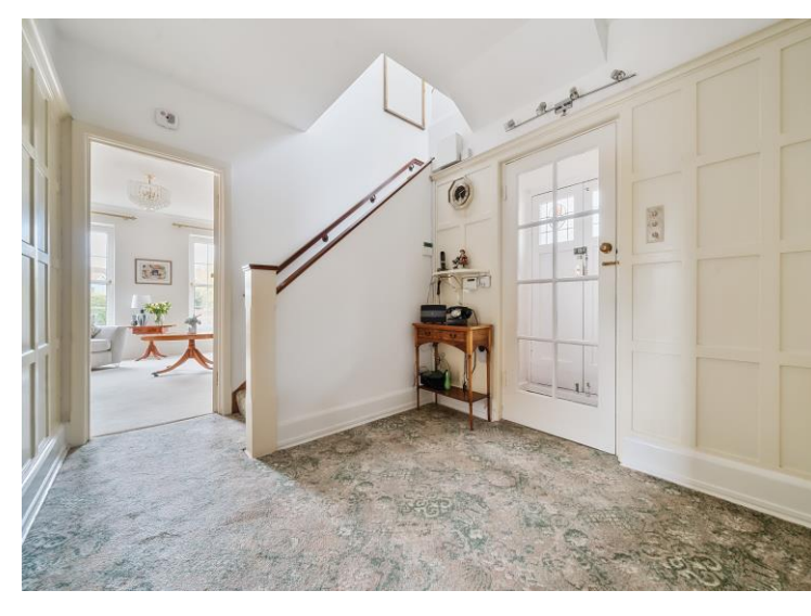
To view this property call Colebrook Sturrock on 01303\ 260666