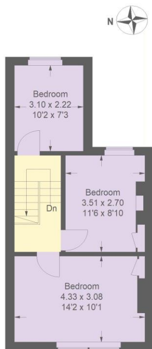
First Floor 36.8 sq m / 396 sq ft

This plan is for layout guidance only. Not drawn to scale unless stated. Windows and door openings are approximate. Whilst every care is taken in the preparation of this plan, please check all dimensions, shapes and compass bearings before making any decisions reliant upon them. (ID 804685)