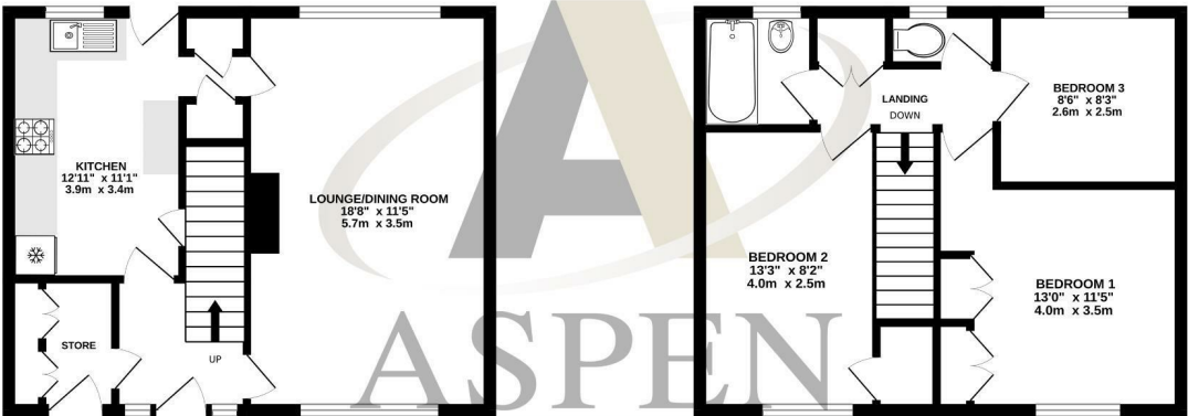
1ST FLOOR 421 sq.ft. (39.1 sq.m.) approx.