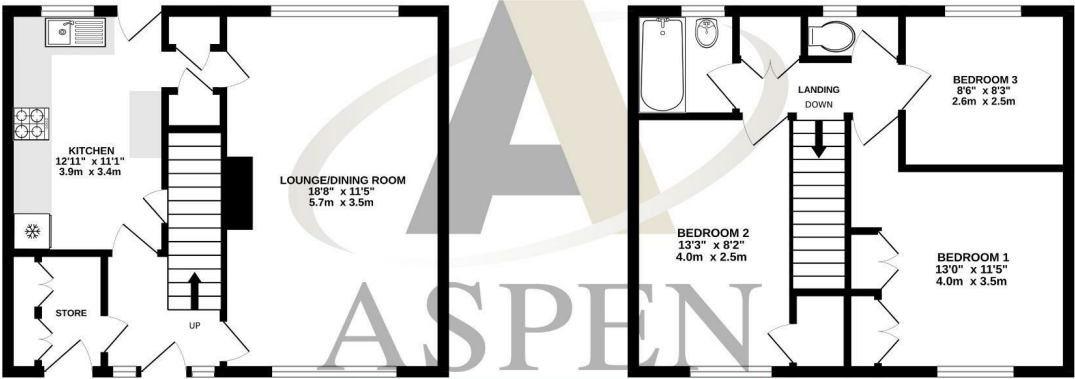
1ST FLOOR 421 sq.ft. (39.1 sq.m.) approx.