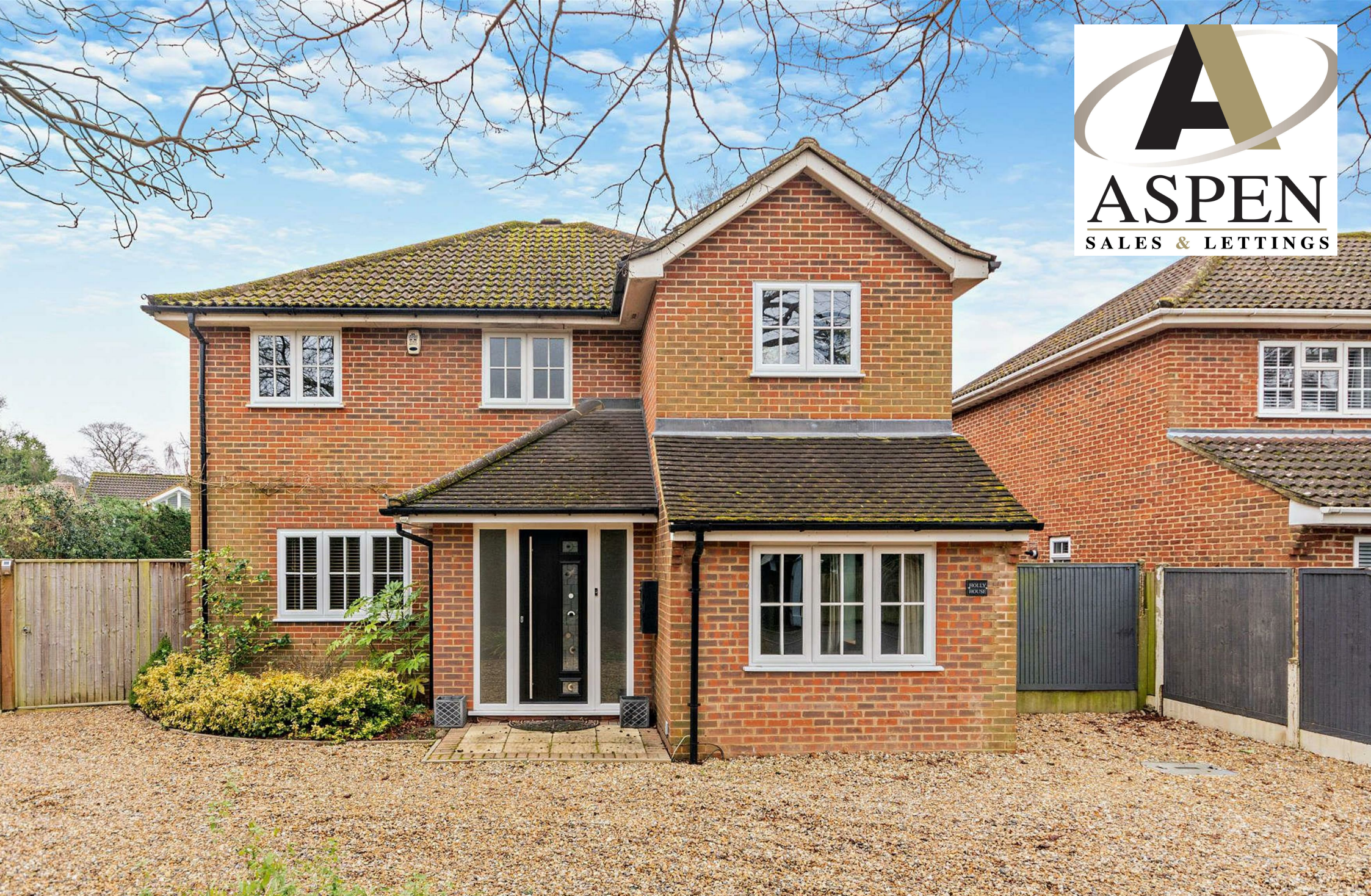
Holly House Bagshot Road, Englefield Green, TW20 0RT