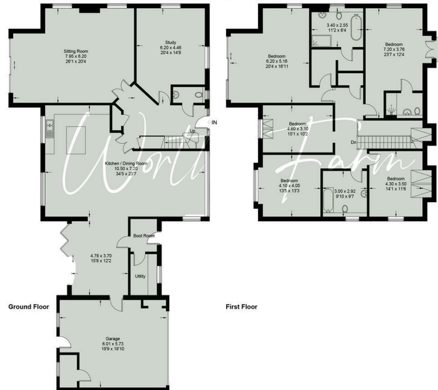
Illustration for identification purposes only, measurements are approximate, not to scale. Imageplansurveys @ 2020

Approximate Gross Internal Area = 340.5 sq m / 3665 sq ft Garage = 40.2 sq m / 433 sq ft Total = 380.7 sq m / 4098 sq ft