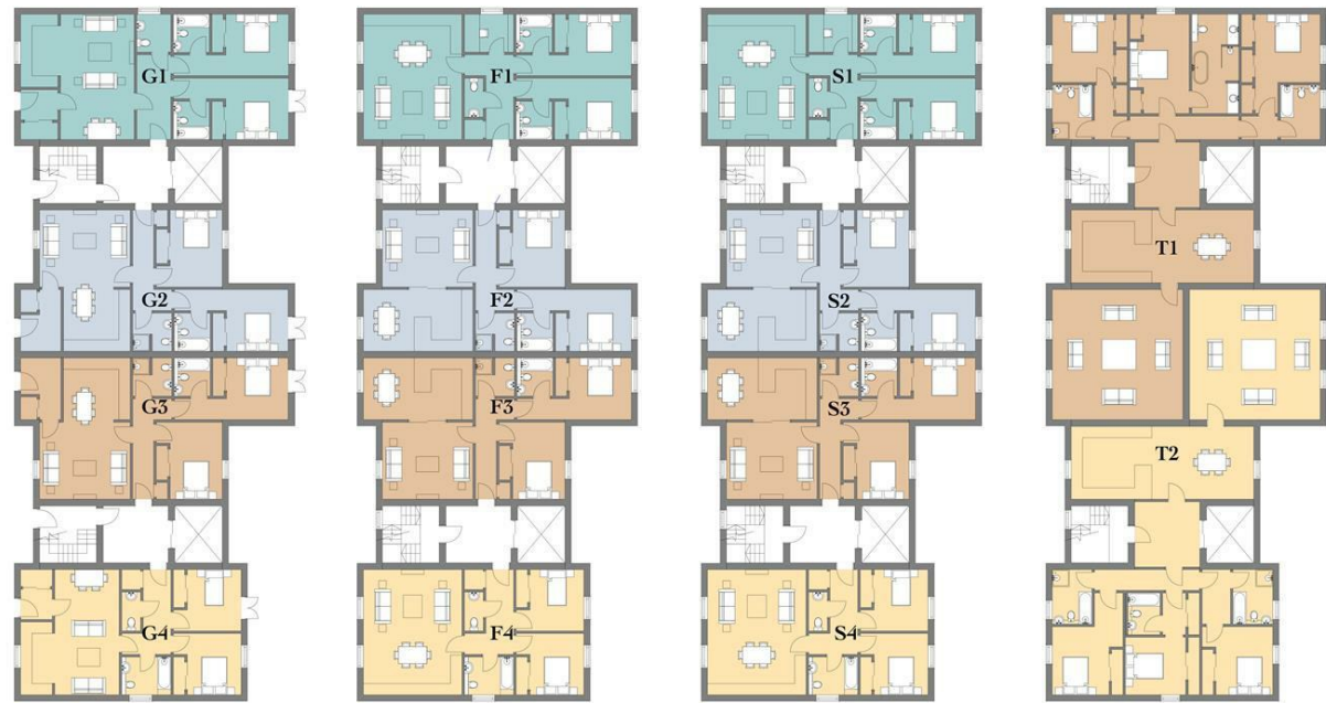
Proposed Ground Floorplan @ 1:100

G1 = 93sqm G2 = 86sqm G3 = 86sqm G4 = 76sqm