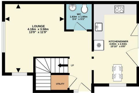
GROUND FLOOR 37.8 sq.m. (407 sq.ft.) approx.