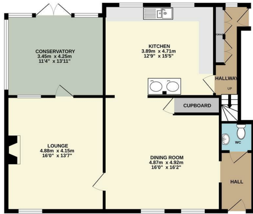
GROUND FLOOR 86.6 sq.m. (932 sq.ft.) approx.