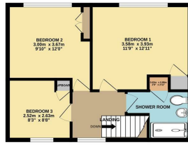
1ST FLOOR 42.8 sq.m. (461 sq.ft.) approx.