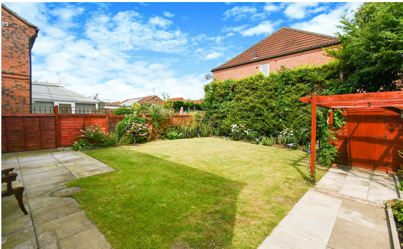
Bathroom 7'7 x5'7 (2.31m x1.70m) Front & Rear Gardens