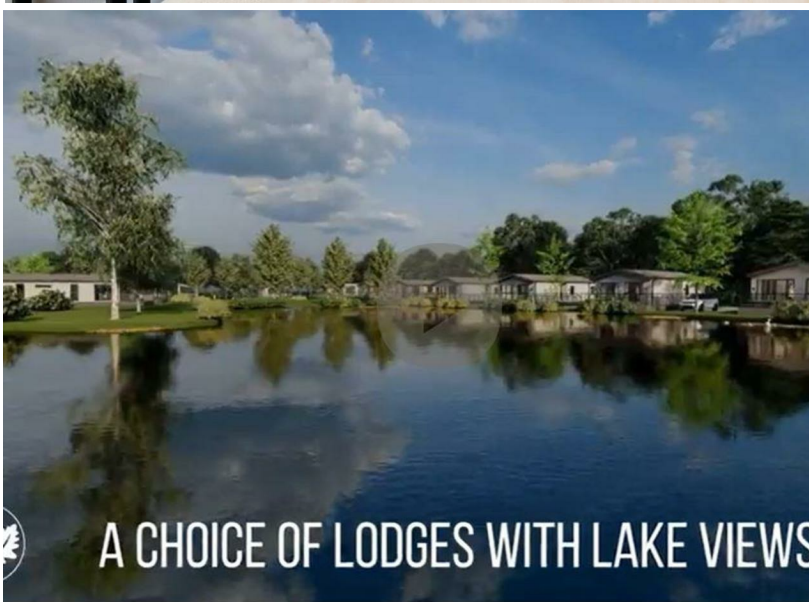
A CHOICE OF LODGES WITH LAKE VIEWS