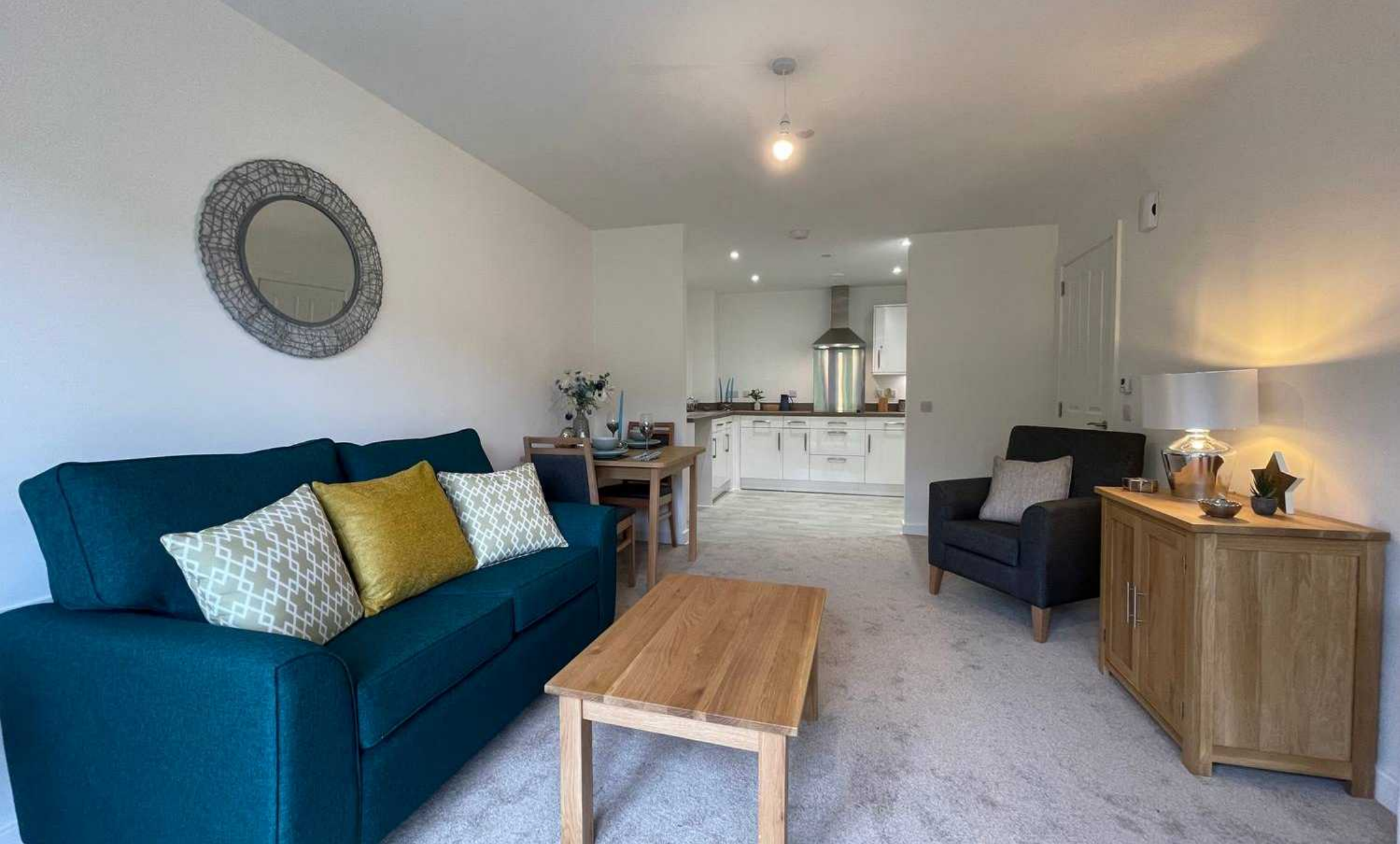
The Cedar, Castlestead View, Kendal