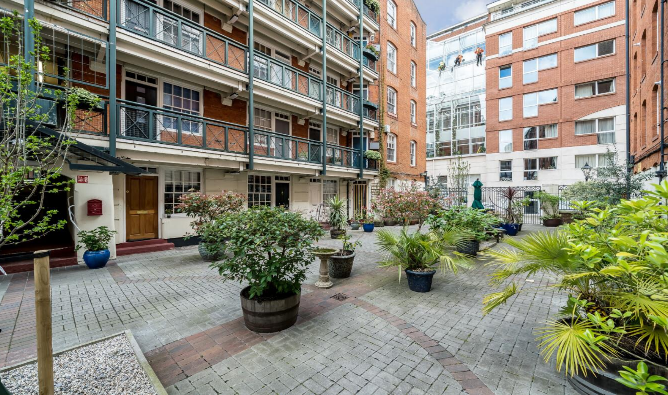
Martlett Court, Covent Garden London WC2B 5SD