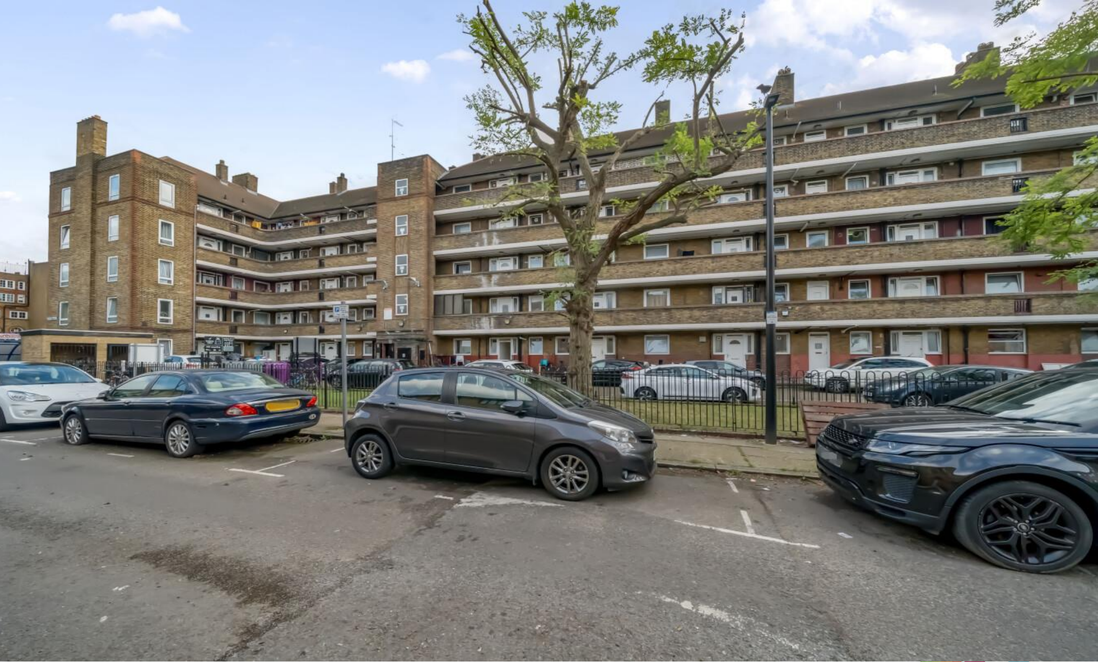
Northesk House Tent Street, London E1 5DS