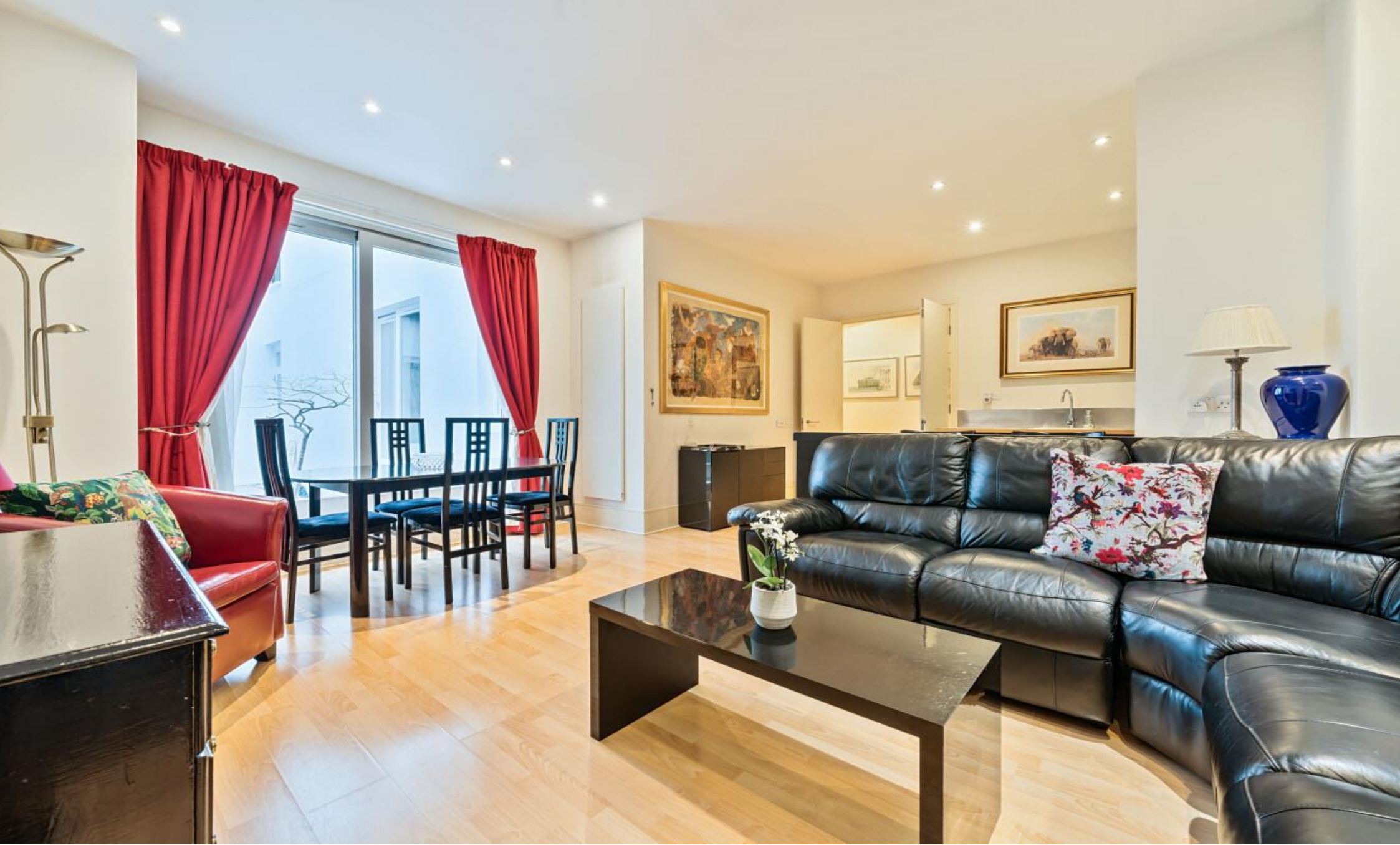
Drury Lane, Covent Garden, London WC2B