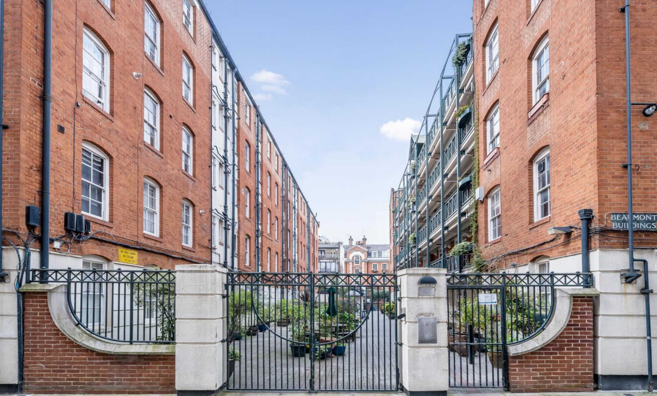
Beaumont Buildings, Martlett Court, Covent Garden, London WC2B