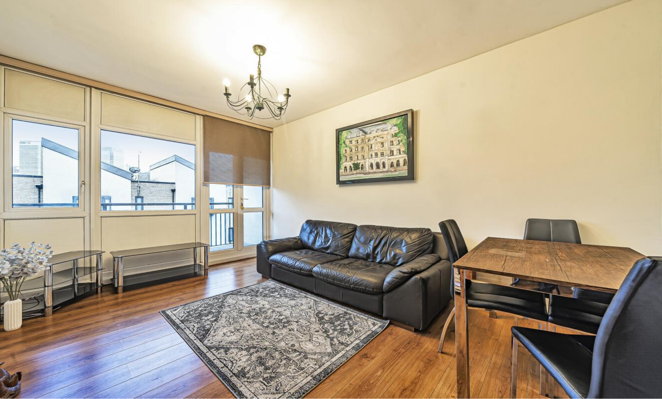
Charlesworth House, Dod Street, London E14