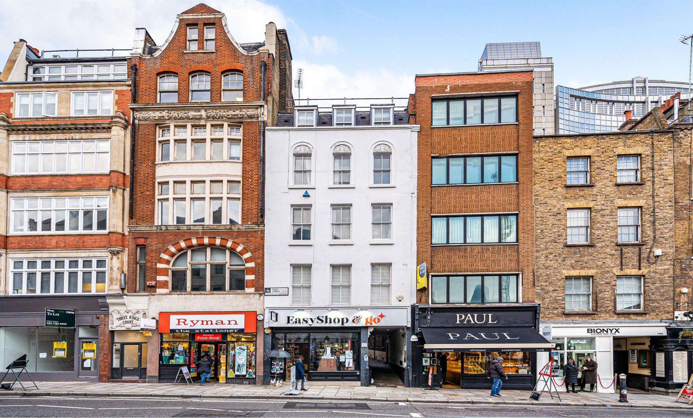
Fleet Street, City Of London, London EC4A 2BU