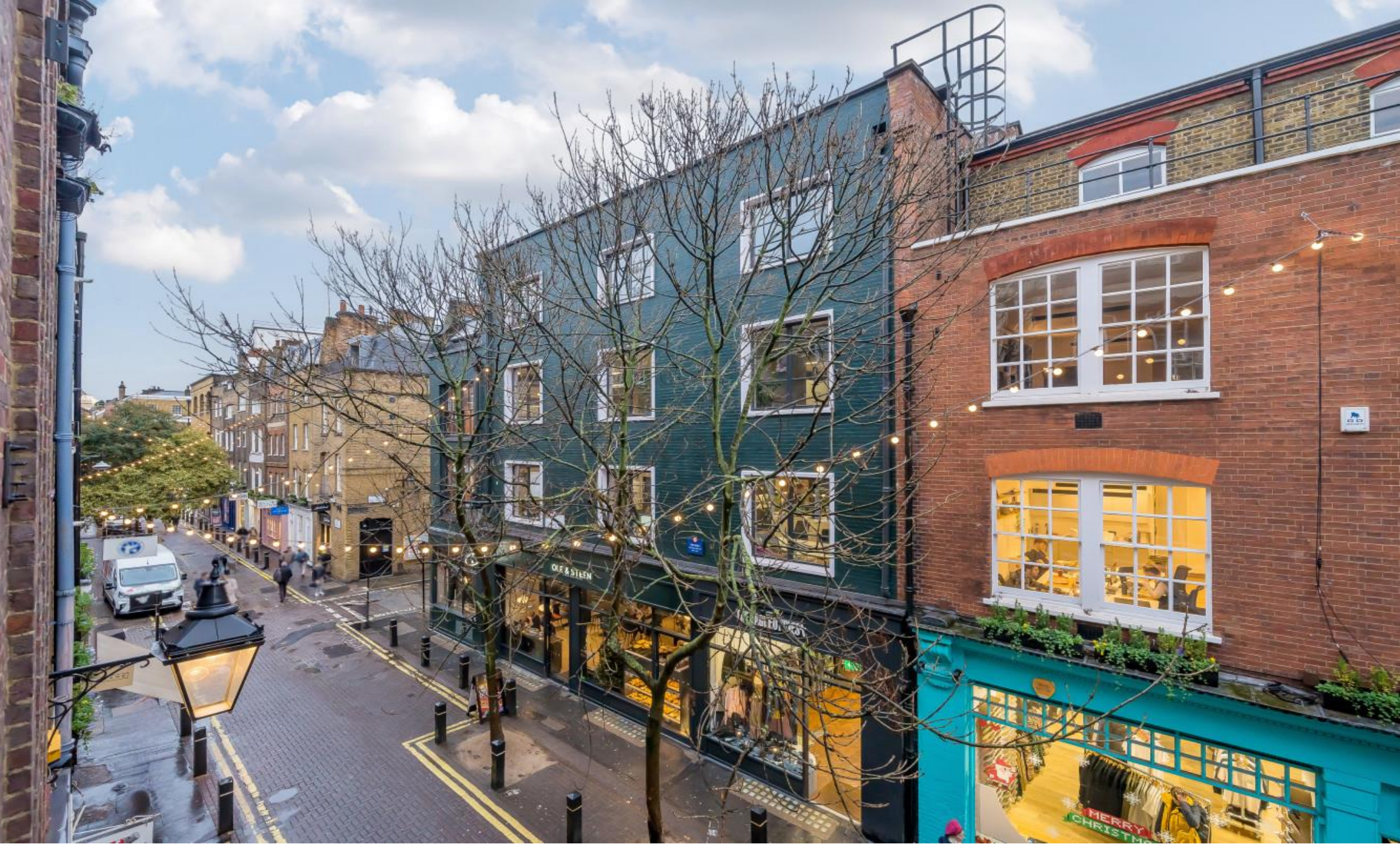
Neal Street, Covent Garden London WC2H 9PA