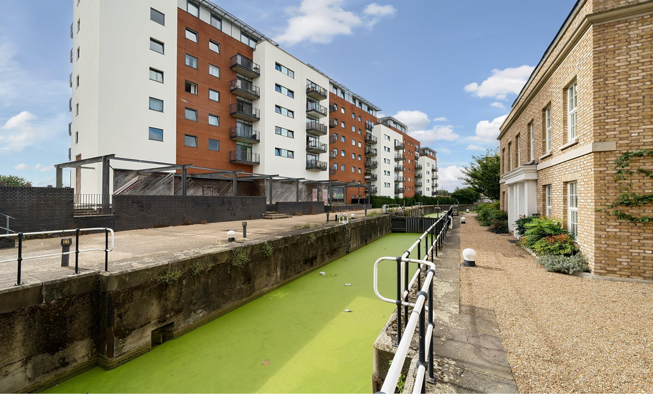
The Lock Building, High Street, Stratford, London E15