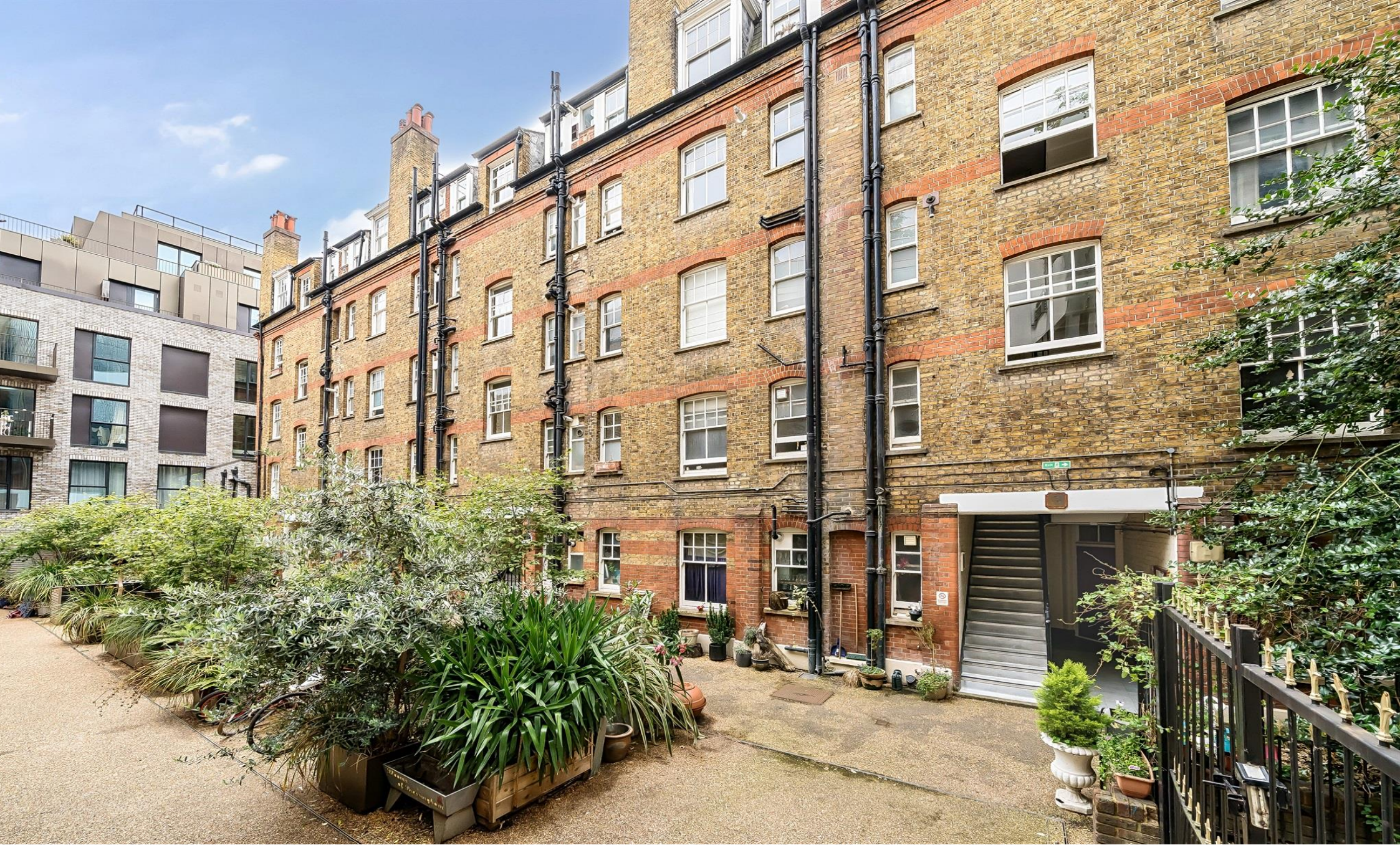
Aldwych Buildings, Parker Mews, Covent Garden, London WC2B 5NT