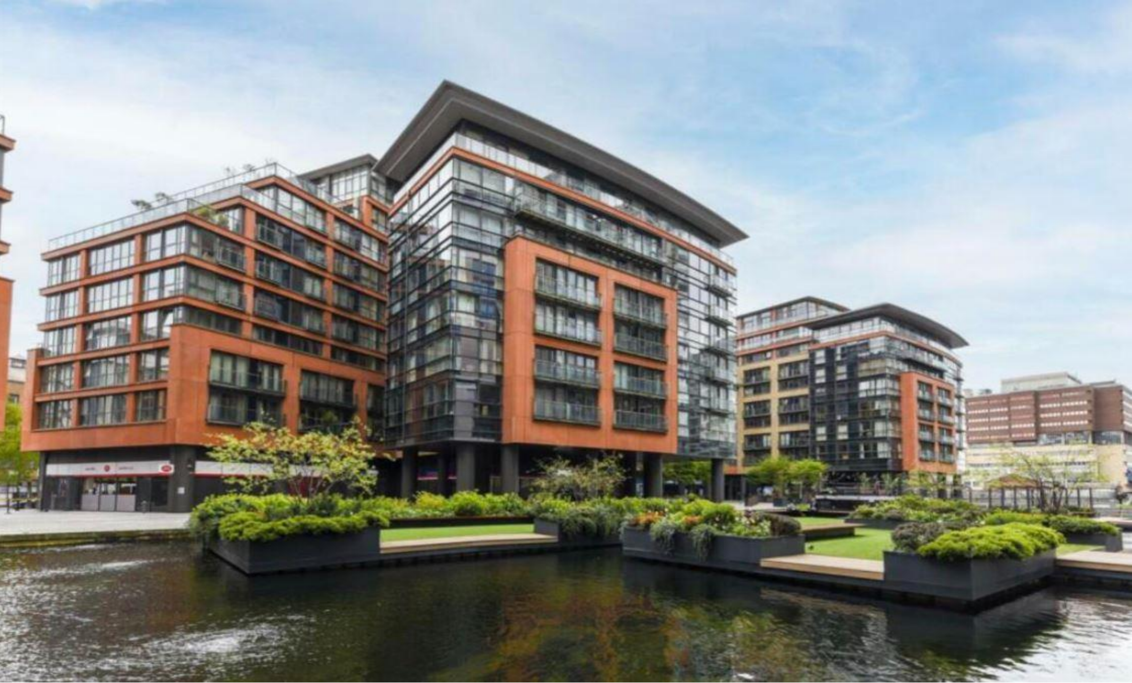
Peninsula Apartments, Praed Street, London W2 1JE