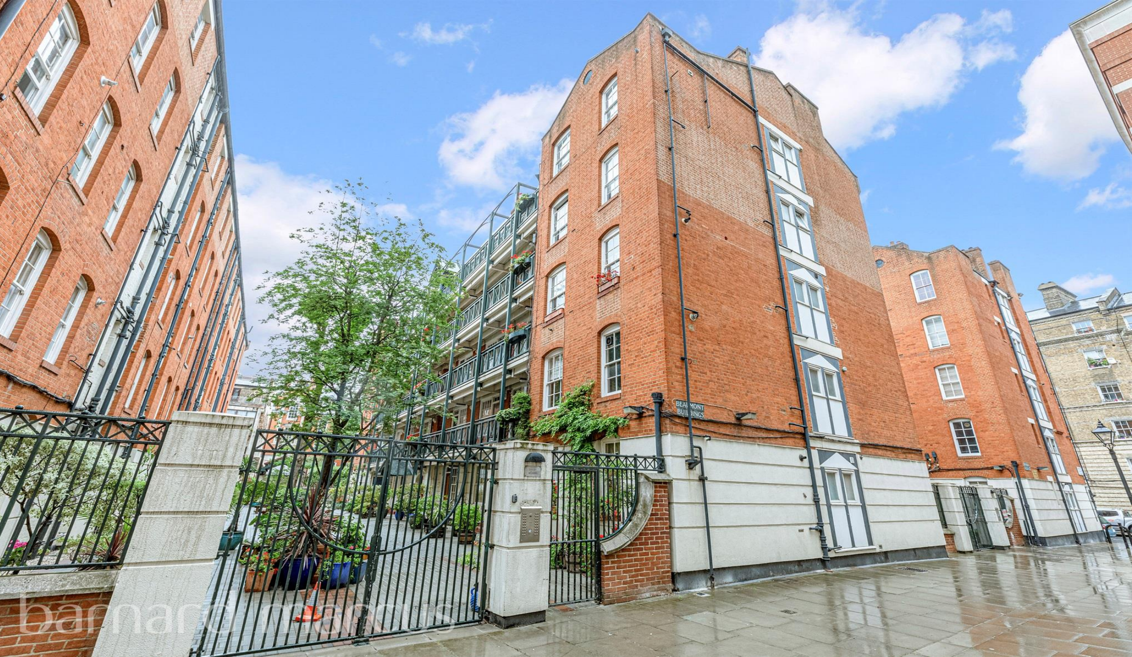
Martlett Court, Covent Garden, London WC2B