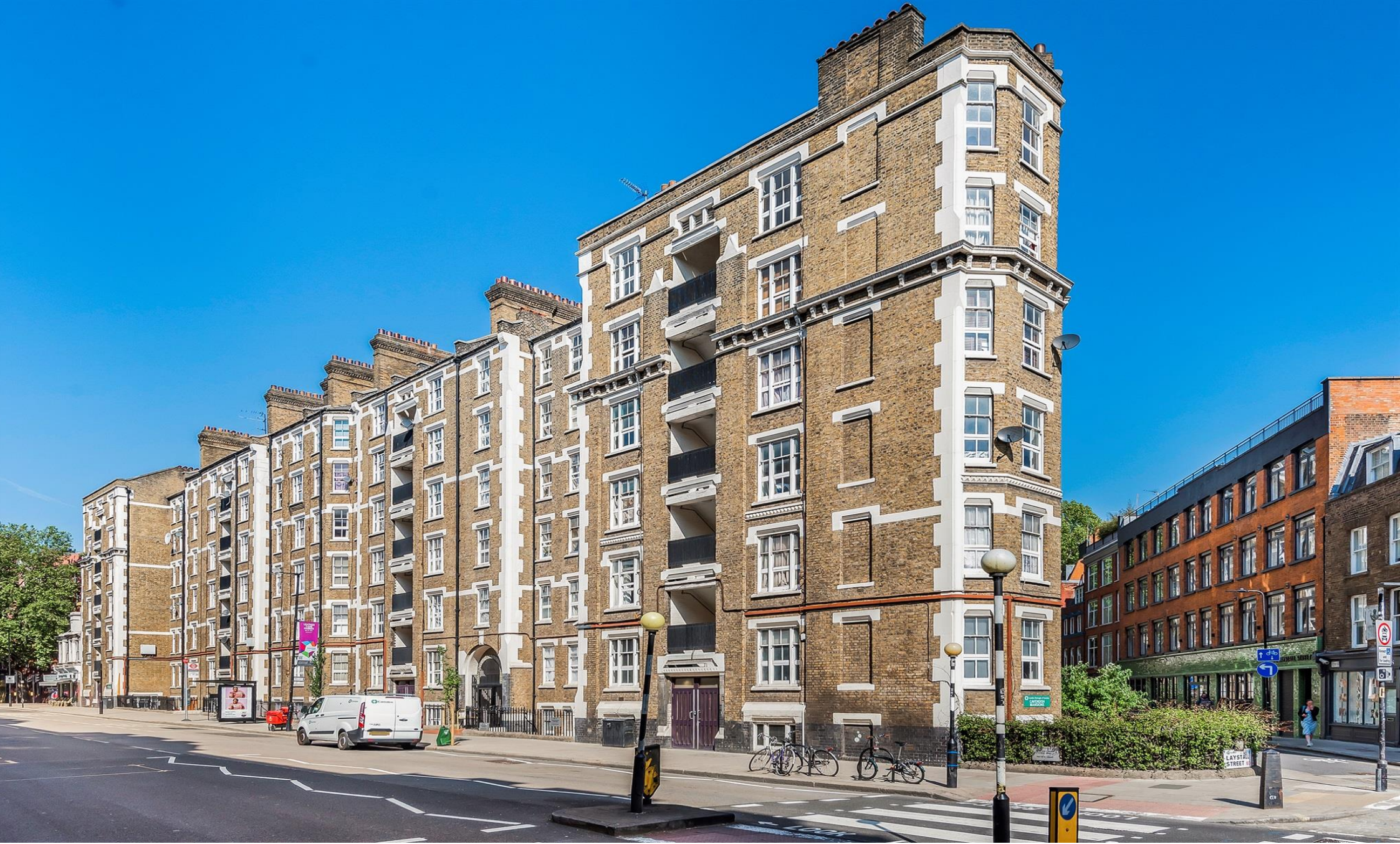
Cavendish Mansions Clerkenwell Road London EC1R