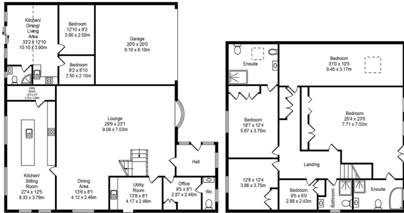
Approx. Floor Area 2355 Sq.Ft (218.76 Sq.M.)

Whilst every effort is made to accurately reproduce these floor plans, measurements are approximate, not to scale and for illustrative purposes only