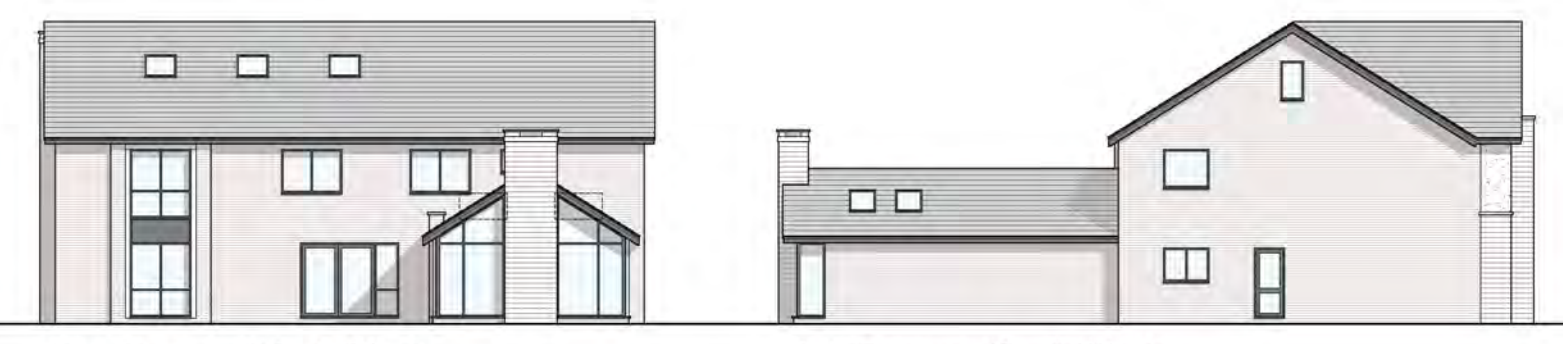
Rear Elevation (North West)