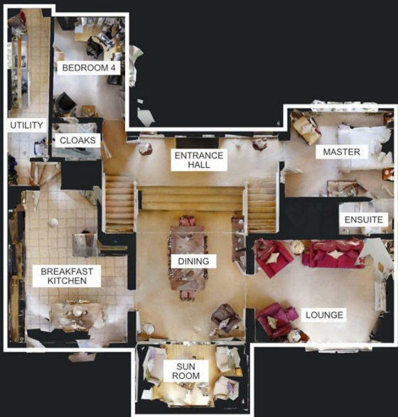
Ground & Lower Ground Floor