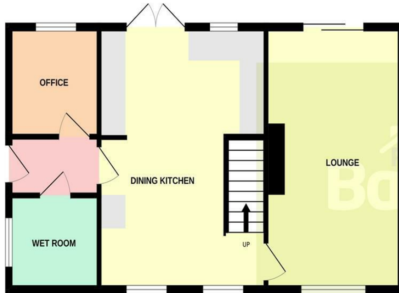
GROUND FLOOR 620 sq.ft. (57.6 sq.m.) approx.