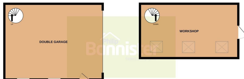
1ST FLOOR 374 sq.ft. (34.7 sq.m.) approx.

TOTAL FLOOR AREA : 894 sq.ft. (83.1 sq.m.) approx.