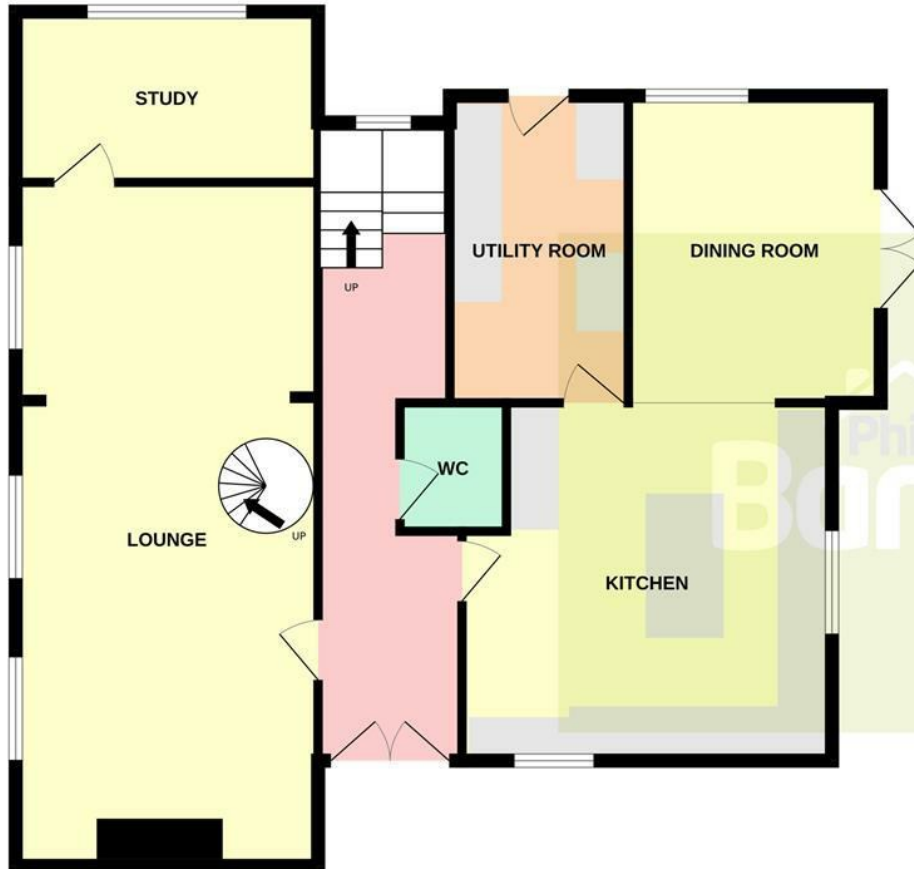
GROUND FLOOR 1051 sq.ft. (97.6 sq.m.) approx.