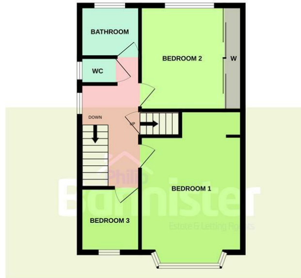
1ST FLOOR 472 sq.ft. (43.9 sq.m.) approx.