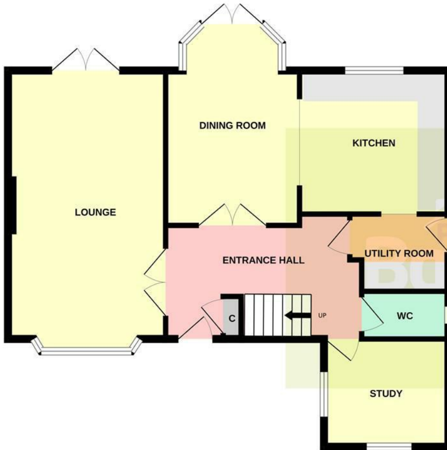
GROUND FLOOR 739 sq.ft. (68.7 sq.m.) approx.