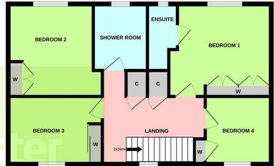
1ST FLOOR 639 sq.ft. (59.3 sq.m.) approx.