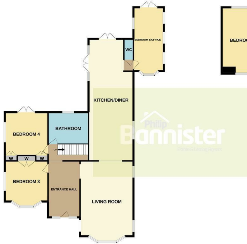
GROUND FLOOR 1557 sq.ft. (144.7 sq.m.) approx.