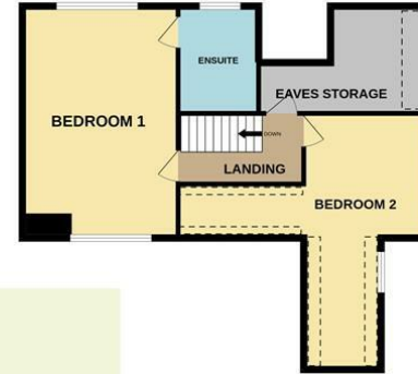
1ST FLOOR 652 sq.ft. (60.5 sq.m.) approx.